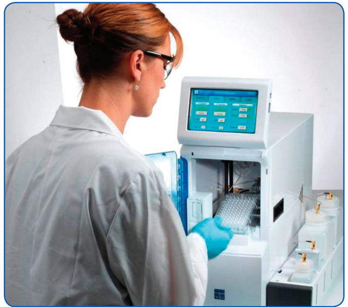
YSI 2900 Biochemistry Analyzer