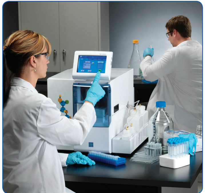
YSI 2950 Biochemistry Analyzer